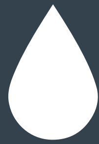
water & oil